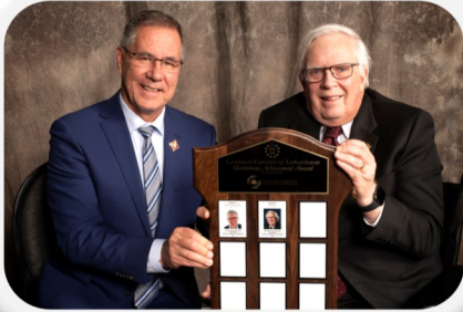
Lieutenant Governor of SK Meritorious Achievement Award