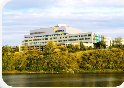
Brian Eckel - Buildings