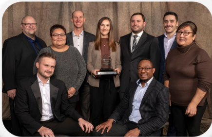
Community Initiative Award