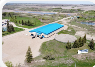
Brian Eckel - Municipal Infrastructure & Water Resources