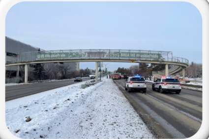
Brian Eckel - Transportation