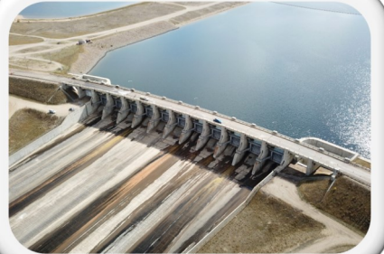
Brian Eckel - Studies and Soft Engineering